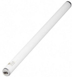
Fluorescent tubes / light globes