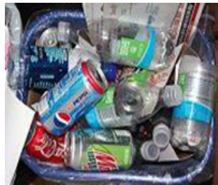
Bottles & Cans