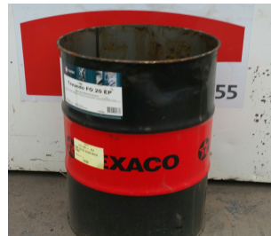
Empty oil & grease drums