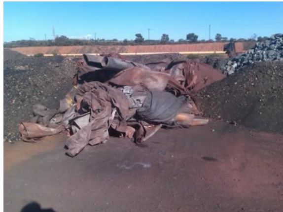
Hard fill dump contamination