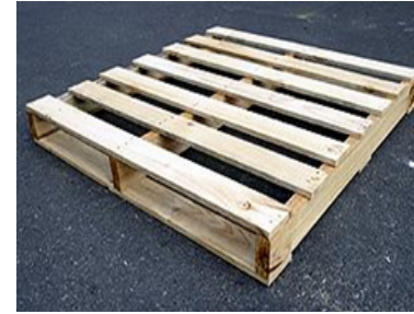
Timber / Pallets / Crates