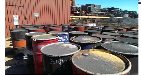
Waste Oil / Oily water