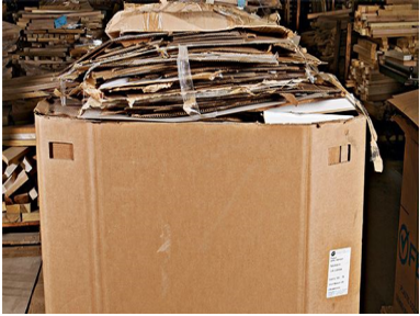
Cardboard / Paper

Do not place any of these in the general waste bins