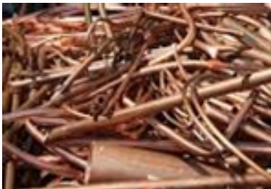
Copper / Electrical cables