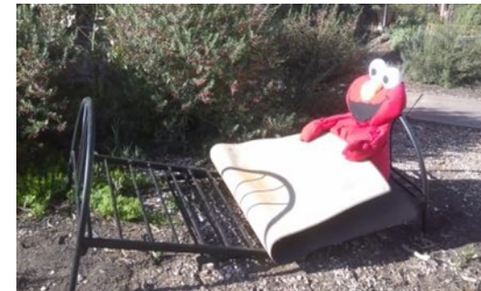
Household waste disposed of onsite