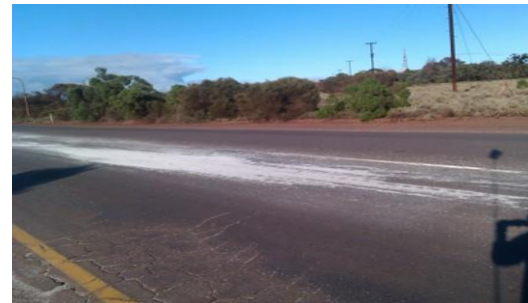
Spillage on roads